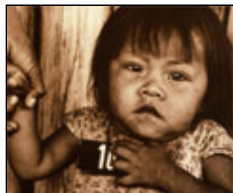
Claudia Andujar - Marcados para Morrer (Marked to Live, Marked to Die)